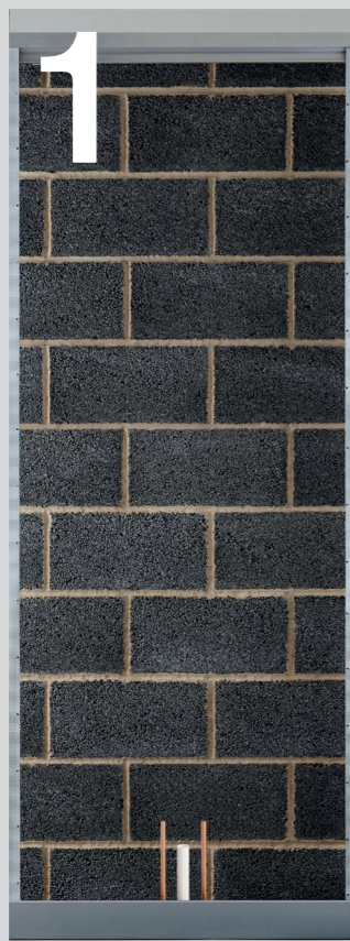
01 Once the site has been prepared, fix the aluminium docking frame to the wall, ceiling and floor.

Frameduct's superbly crafted, metal-framed panelling has been created to give you quick and easy installation. Its clever click-fix mechanism is simplicity itself. Not only that, Frameduct gives you the opportunity to choose your own sanitaryware.