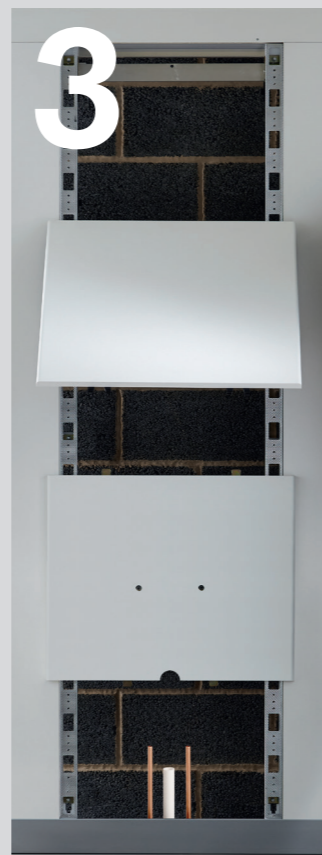
03 Drill or cut out for sanitaryware.