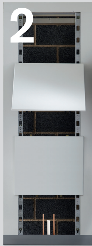
02 Click-fix the first Frameduct unit onto the frame and slide into position. Open the mid panel to a fully hinged position. Attach a vertical flashgap to the frame on either side of the unit, screw-fixing to the frame from the face. Fix tie back to the wall. Repeat until all units are in place.