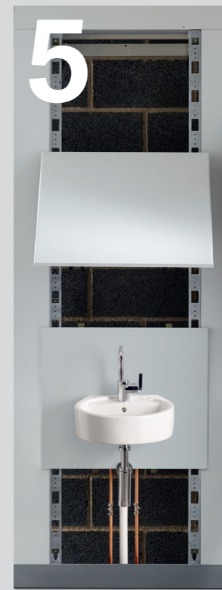
05 Once all the units are in position, connect the plumbing and services and apply silicone sealant to sanitaryware.