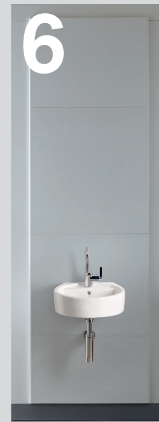
06 Simply close the hinged panel and attach the top and bottom panels of the units. Installation is complete.