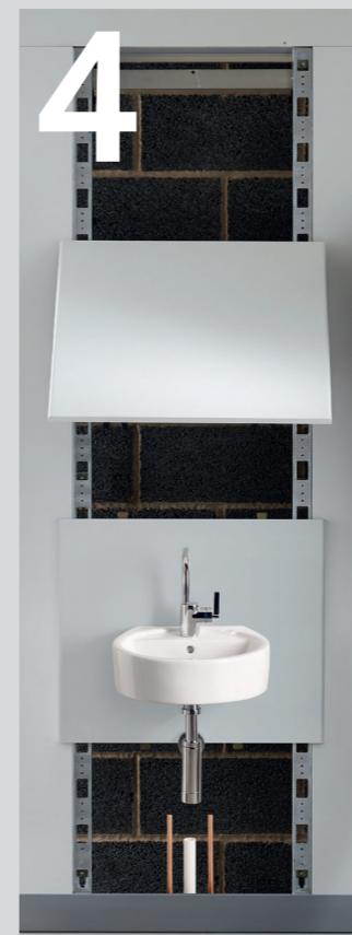
04 Mount sanitaryware and brassware.